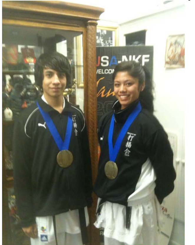
Two of our Black Belts headed to Pan-Am's and World Championships!